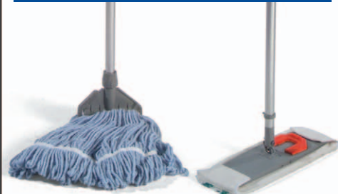
Monsoon Kentucky Mops