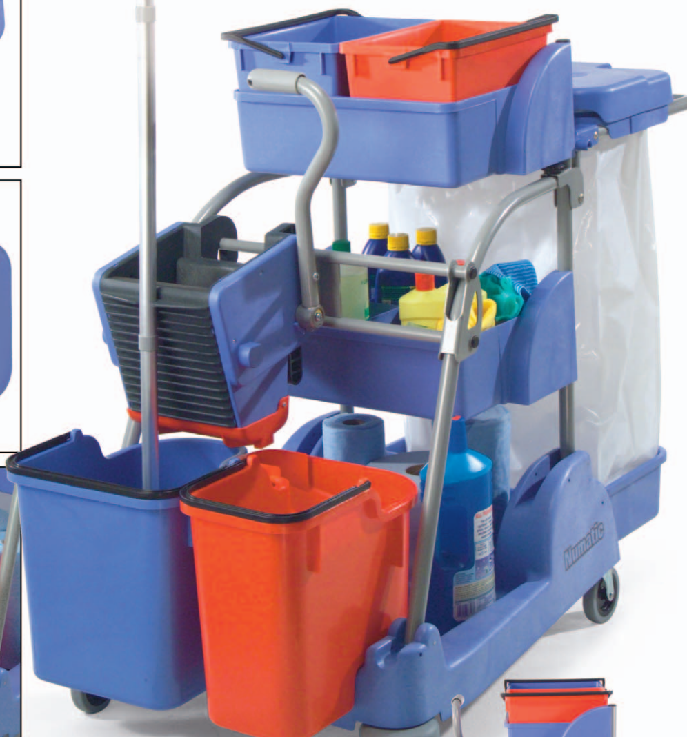
Shown with Kit JT2 (See page 19)