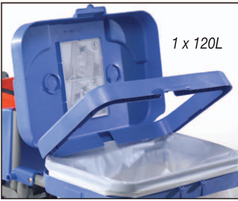
1 x 120L