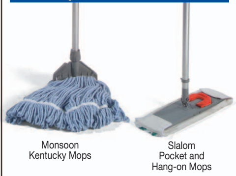
Monsoon Kentucky Mops