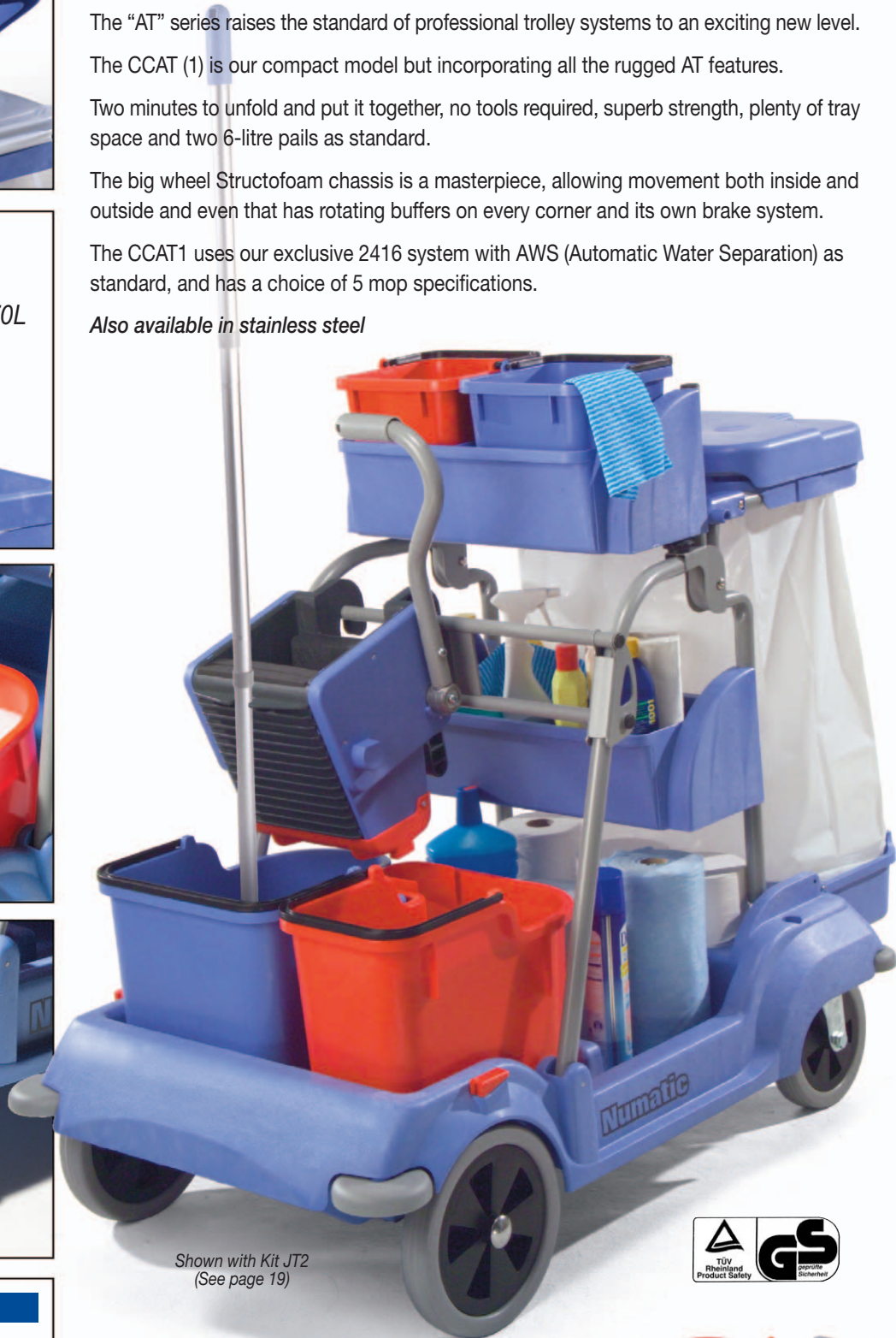
Shown with Kit JT2 (See page 19)