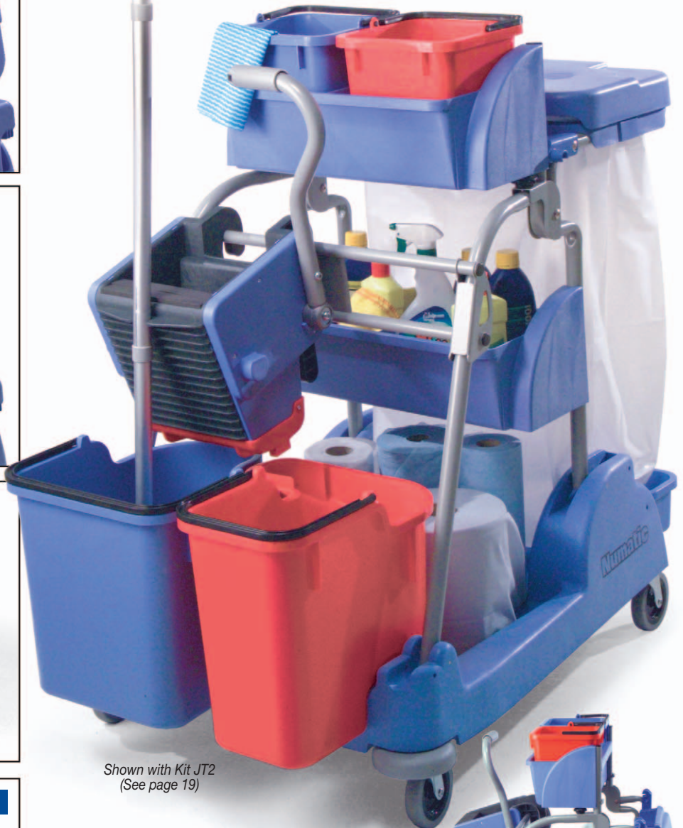
Shown with Kit JT2 (See page 19)