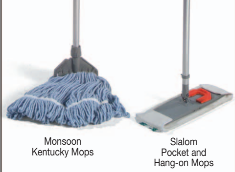
Monsoon Kentucky Mops