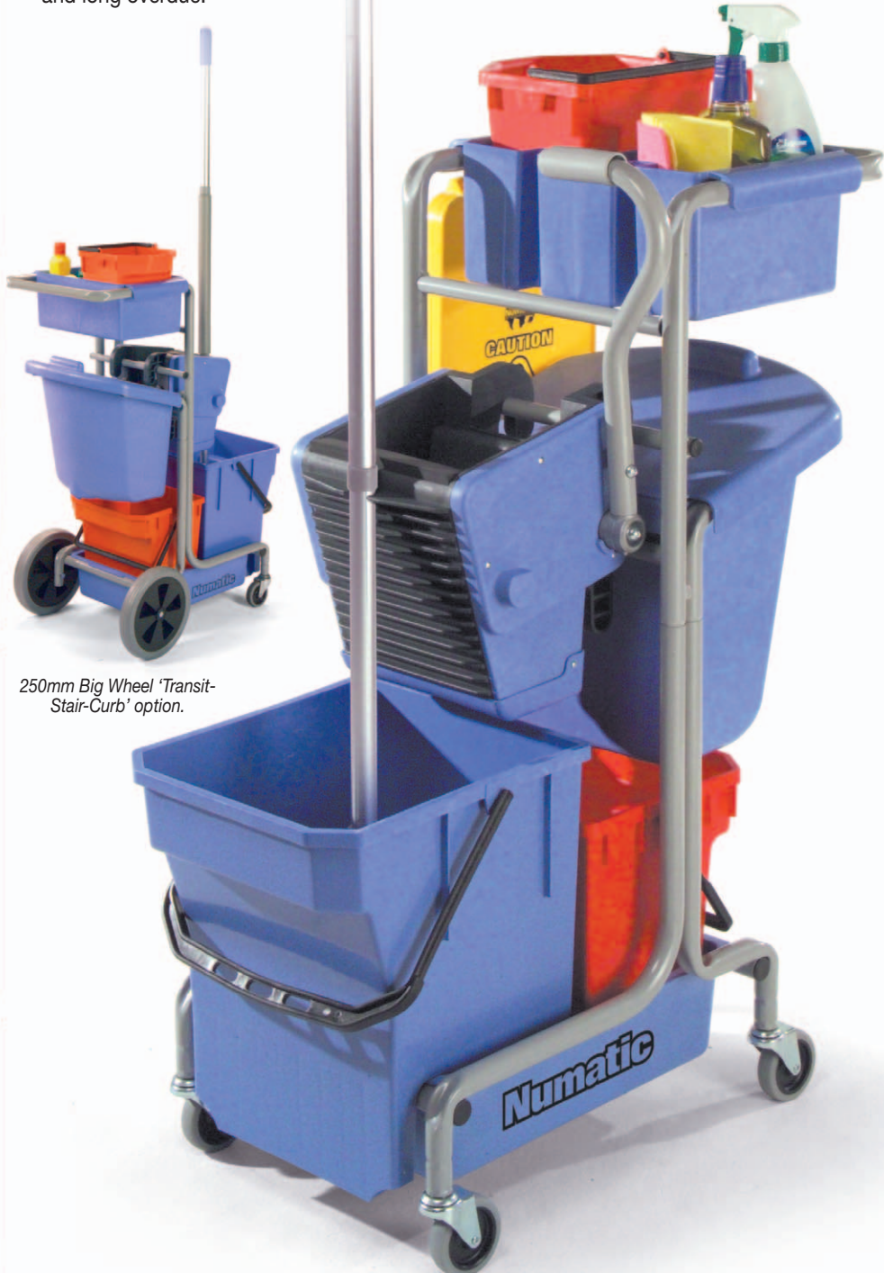
250mm Big Wheel 'Transit-Stair-Curb' option.